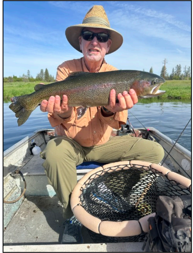
A Fall River lunker. We caught lots of fish this year but most were small. A few 14 to 16 inchers. But you know me, I measure mine in pounds not inches. May 13-16, 2024.