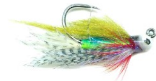
FLOAT & FLY Baitfish Pattern

Favorite fly pattern to share? Drop me a line here.