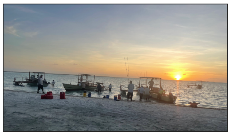
Heading to the boats to get out to the flats