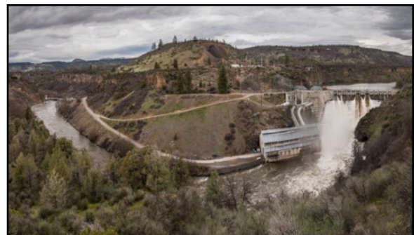
Klamath River Dam | Daniel Nylen