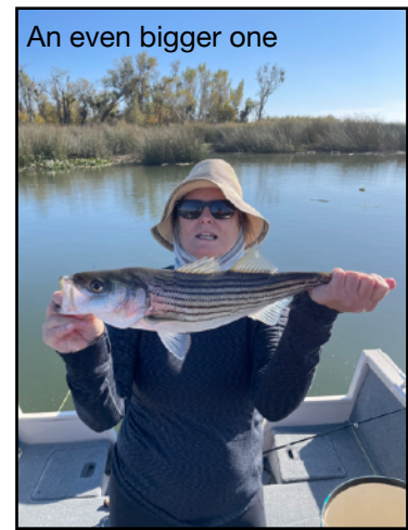
An even bigger one