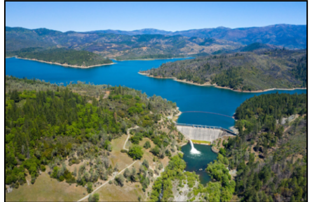
Scott Dam