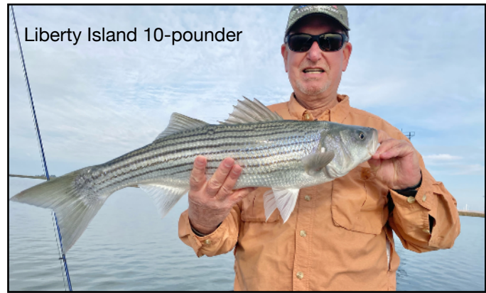
Liberty Island 10-pounder

out of the marina and immediately saw birds diving the water and started casting to that area and were rewarded with several fish. That was the beginning of an awesome day of striper fishing. Pat is an accomplished striper angler and it's fun to fish with someone who knows the ins and outs of the game. I believe every spot we hit but one produced fish. Pat was the hot rod and while I caught 12(?) fish, he caught many more including a beauty of a 10-pounder. I know we boated 30-plus fish and had more grabs and dropped