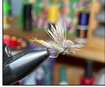
Cutter's E/C Caddis

Middle Fork still looked to be running a bit high to fish comfortably.