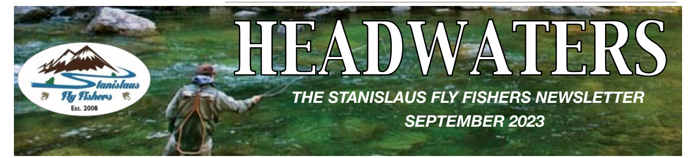
Stanislaus Fly Fishers Newsletter