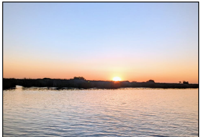
Delta