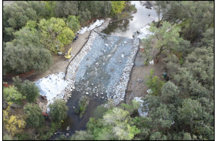
Hemphill Dam after rehabilitation.