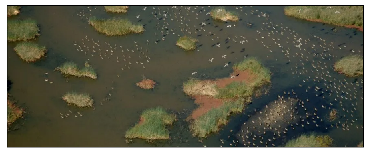
What we Know the Bay-Delta can be - - If We Take the Appropriate Actions

\frac{https://mavensnotebook.com/2021/02/03/planning-conservation-league-the-bay-delta-water-quality-control-plan-where-is-it-at/