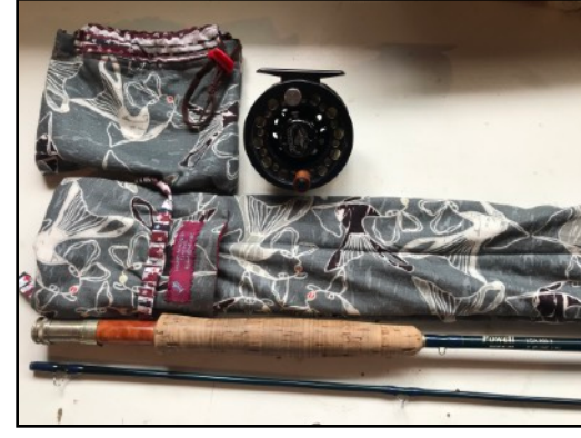
9ft 9wt Powell Tiburon II/Tioga Teton Trinity