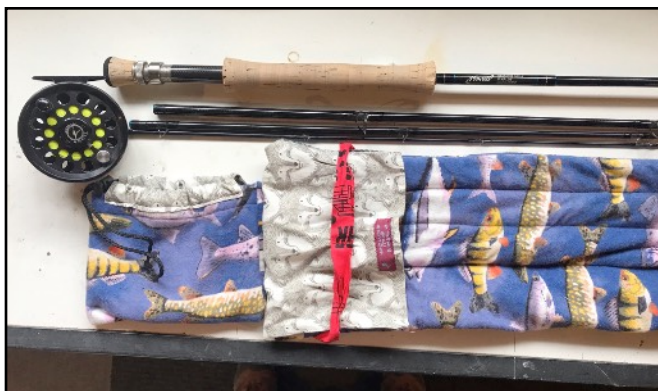
9ft 9wt Powell Tiburon II/Tioga Teton