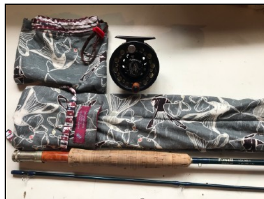
9ft 3wt Powell LGA/Tioga Trinity