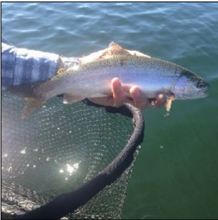
Dennis Stambaugh Crane Prairie Reservoir Bend, OR