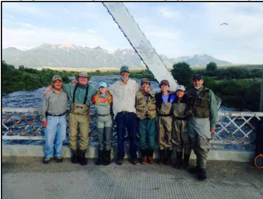
Hanging at the $3 Bridge (better than hanging from the $3 Bridge)